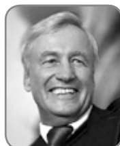
Ole von Beust First Mayor of the Free and Hanseatic City of Hamburg