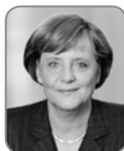
gmec & SMM Patron Dr Angela Merkel Federal Chancellor Federal Republic of Germany