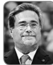
Micky Arison Chairman & CEO Carnival Corporation