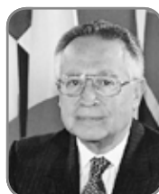
gmec & SMM opening address Efthimios Mitropoulos Secretary-General International Maritime Organisation