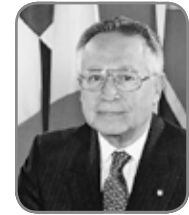
Efthimios Mitropoulos Secretary-General International Maritime Organisation