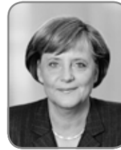
Dr Angela Merkel Federal Chancellor Federal Republic of Germany